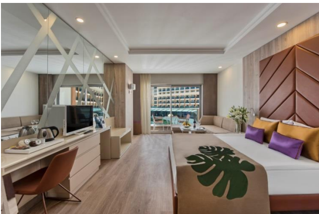
BE Family A