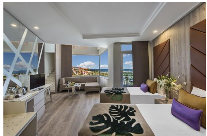
BE Family Loft