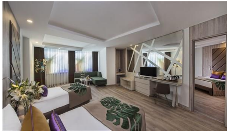
BE Family B