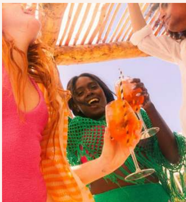
Entertainment worth building a vacation around