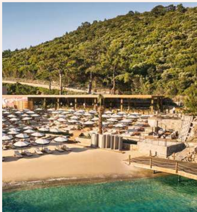
Golden sand beach