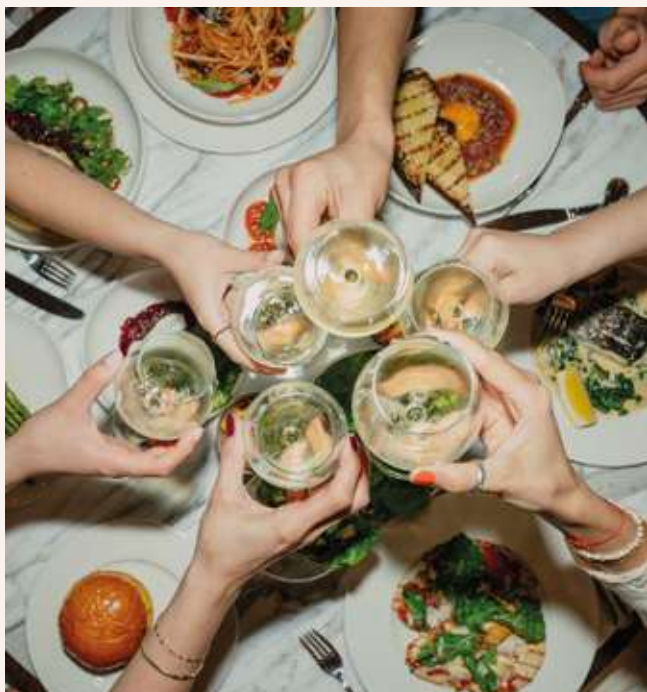
Ultra-all-inclusive adults only lifestyle getaway