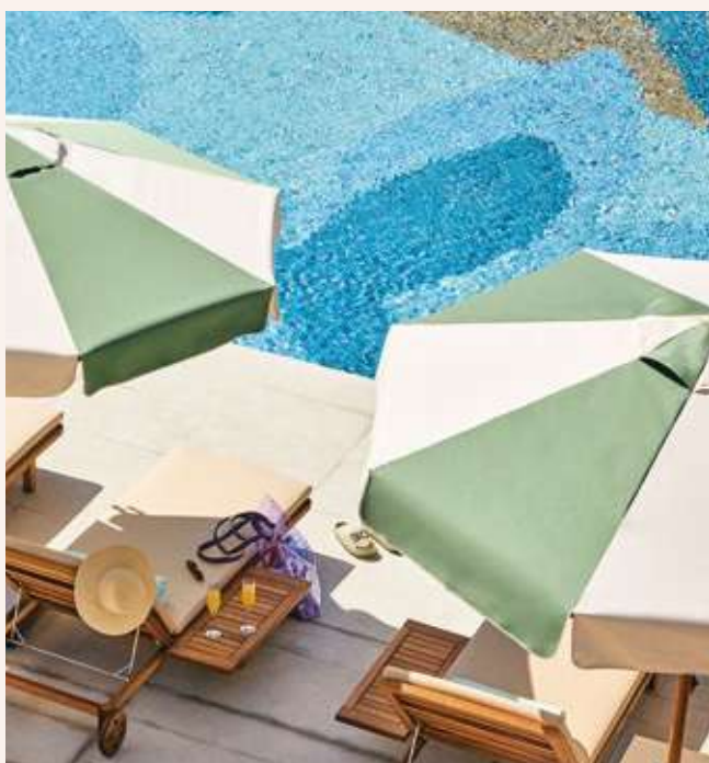
Outdoor swimming pool