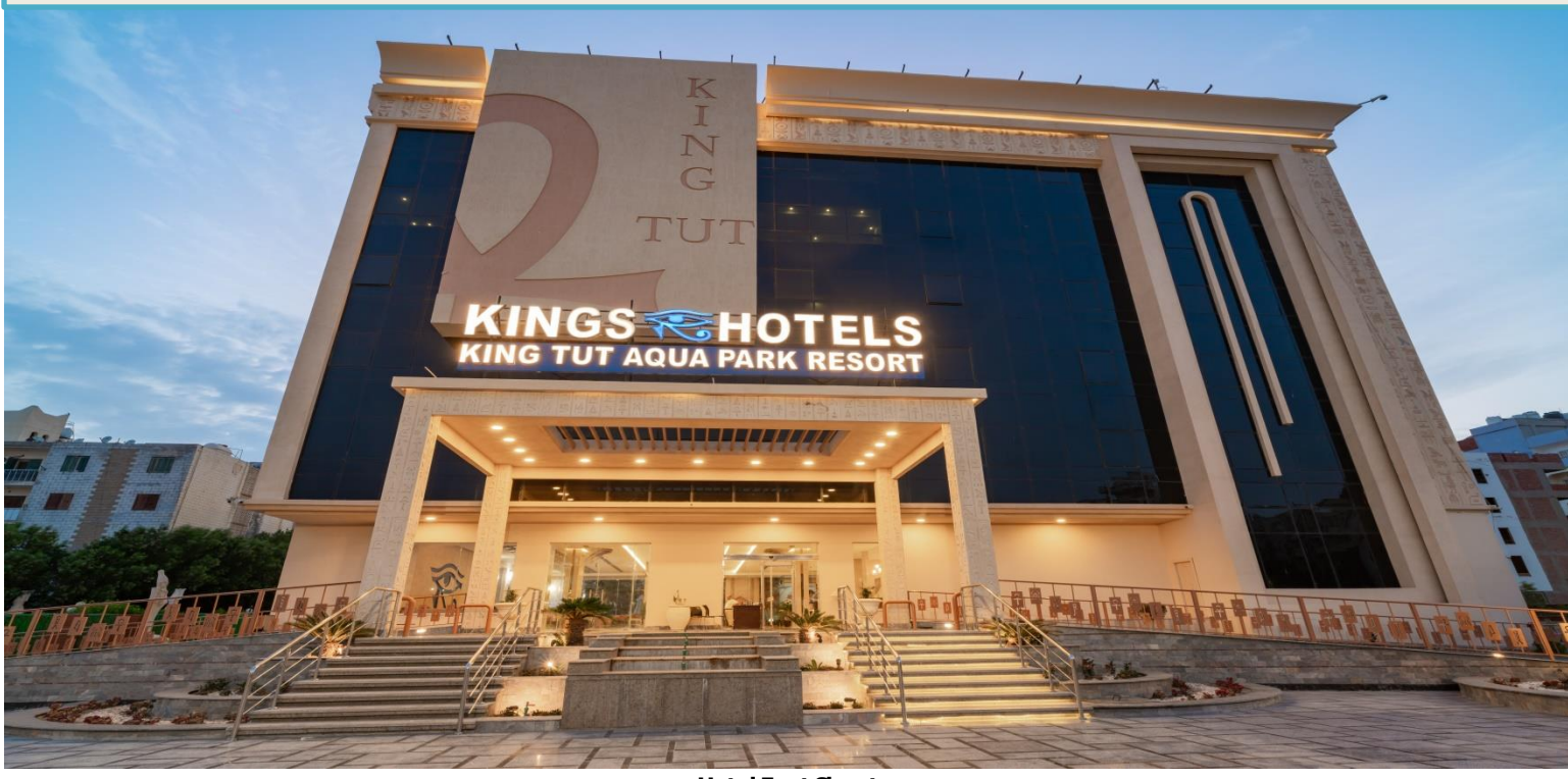
Hotel Fact Sheet