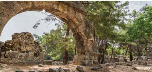
Kemer / Phaselis Antik Kenti

Hotel management may change the location and time of all services and activities, as well as the opening and closing hours of restaurants and bars, according to season and weather conditions.