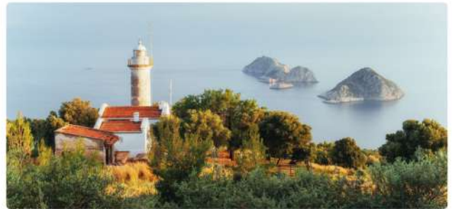
Uç adalar (Three Islands)