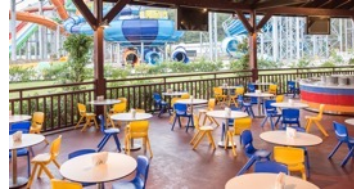
RIXY KIDS CLUB RESTAURANT