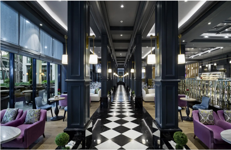
Eclair Coffee Lounge