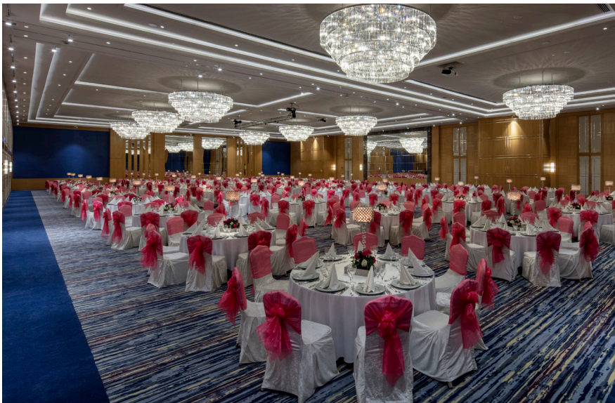
Tourmaline Tourmaline 1 Tourmaline 2