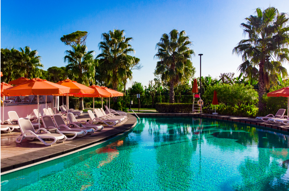
Heated Outdoor Pool