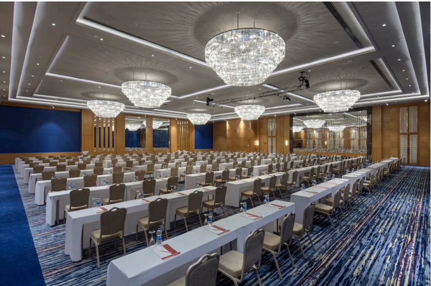
Tourmaline Tourmaline 1 Tourmaline 2