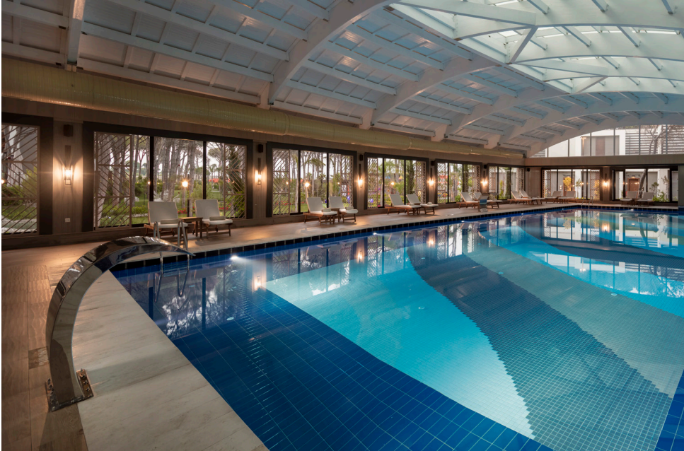
Indoor Pool (Heated)