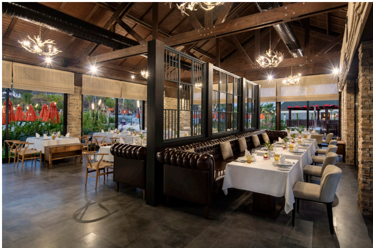
The Red (Steak House)