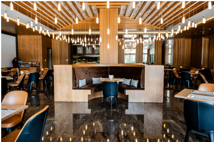
Trendy Main Restaurant