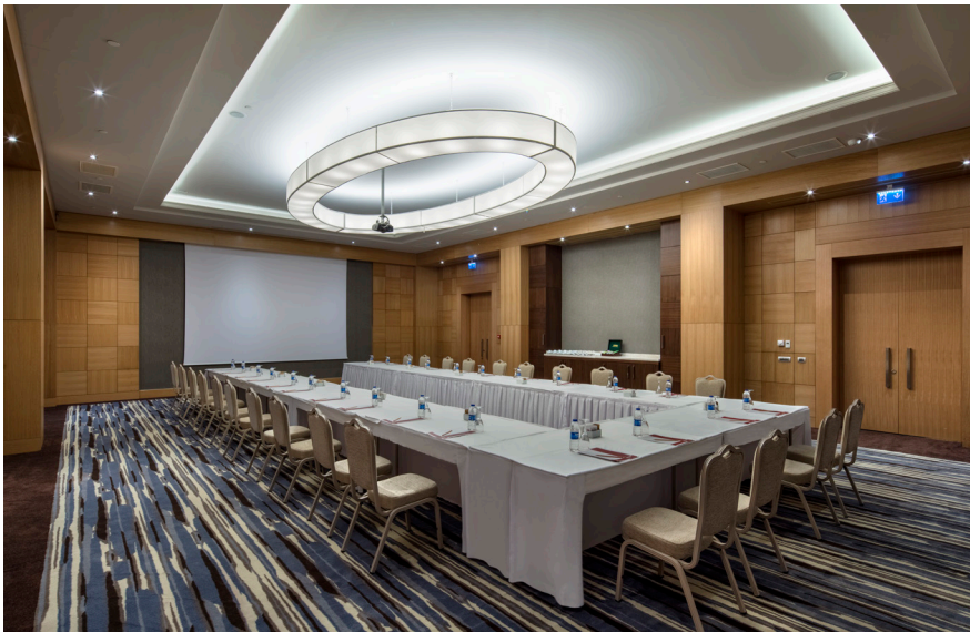
Natrolite Stilbite Adamite Barite Azurite Calcite