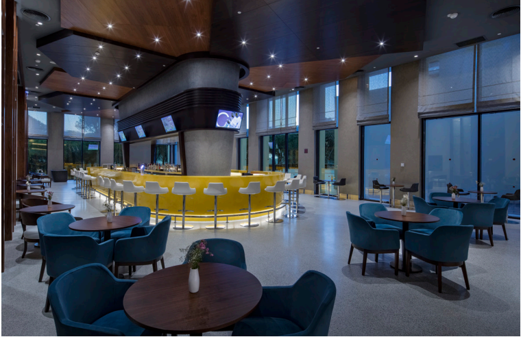
N - Joy Sport Bar