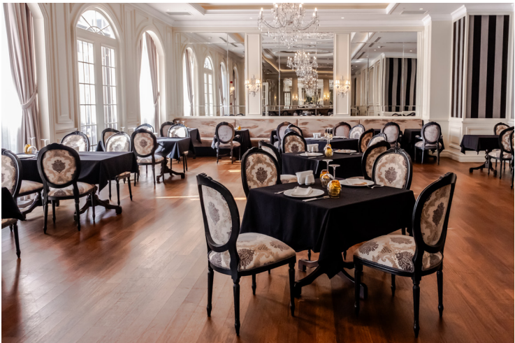
Noma Restaurant (World Cuisine)